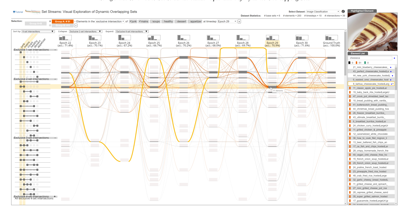
Figure 2: Training of a multi-label classifier for image classification: The timeline shows the predicted labels for each image across various epochs (training stages) of the classifier. The last column represents the ground-truth assignment of labels. The exclusive intersection of labels 'junk' and 'mains' is selected in Epoch 29 (orange) and highlighted on hovering.

changes with m timesteps, we introduce a sequence of families of base sets \mathcal{F} = (F^1, F^2, \dots, F^m) over the same universe V, where each F^k = \{S_1^k, S_2^k, \dots, S_n^k\} consists of the same number of n base sets. Through this, we can follow a set, which represents a categorical attribute of the elements, across time.